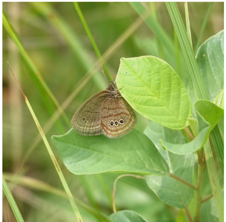
Right: Mitchell's Satyr (male) Fen habitat, MI

Sarett Nature Center 2300 Benton Center Rd. Benton Harbor, MI 49022 Hours: Tuesday—Sunday, Memorial Day through Sept. 30, or as butterflies persist Member fee: Adults $5, Children $3 Non-member fee: Adults $8, Children $4