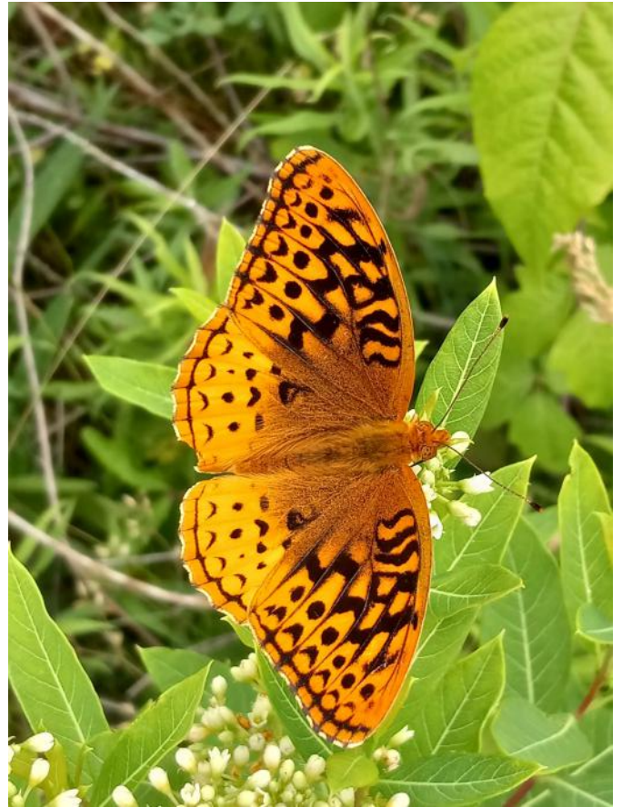
Above: Great Spangled Fritillary Chain O' Lakes State Park, Albion, IN 6/22/23

(No endorsement or discrimination of specific events or vendors on this community calendar is intended or implied.)