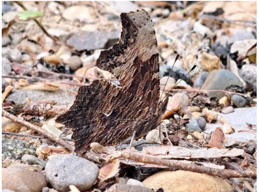
Chain O' Lakes State Park, Albion, IN 6/22/23