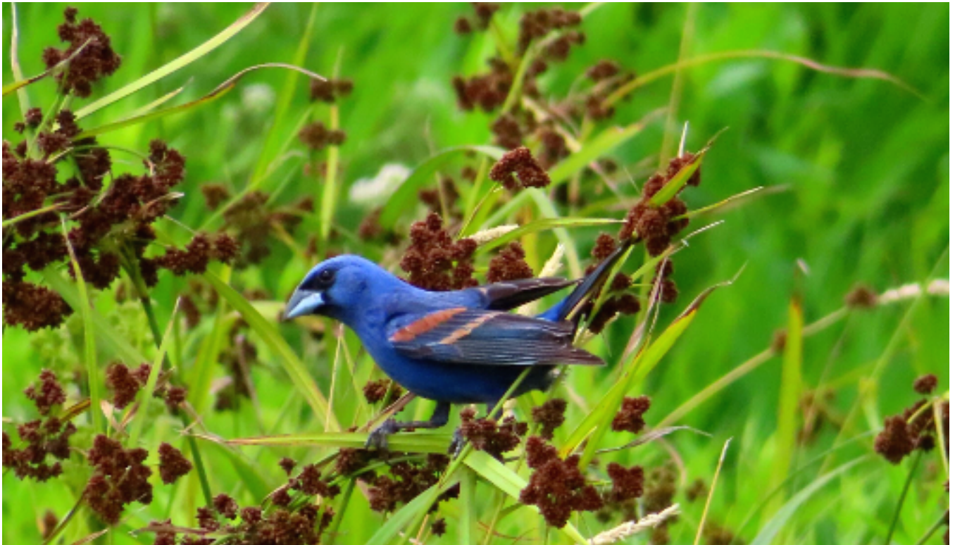
Blue Grosbeak, Mike Metz Fen